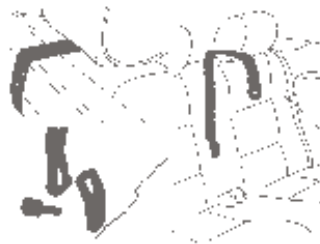
Attaching tether hook to anchorage, 900 convertible